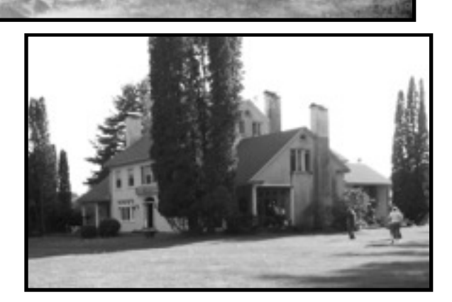
The Rosslyn House on Sinclair Point