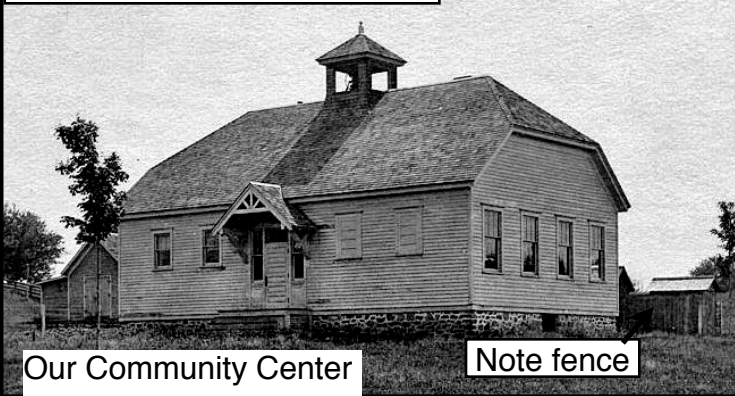
Our Community Center