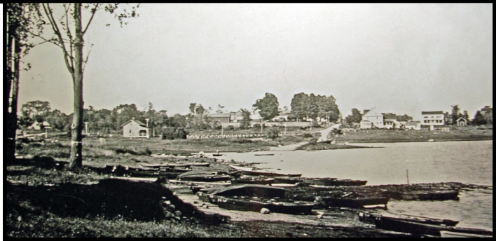
The bay, in front of the store. Notice all the row boats