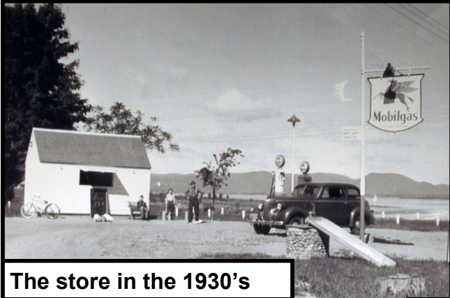
The store in the 1930's