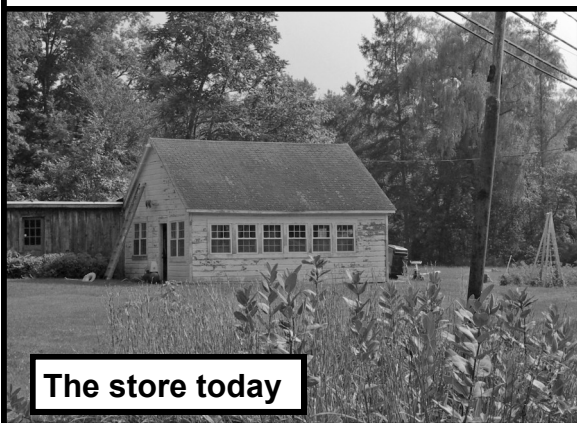
The store today