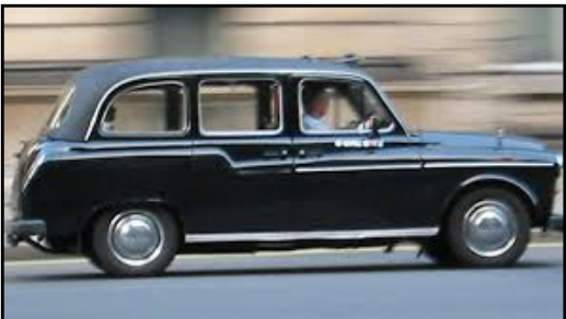
A London Hack or Taxi today