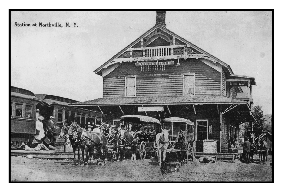
Hacks waiting to take passengers into the village of Northville that had arrived on the F. J. & G railroad.

According to an article on the internet, the first hackneycarriage licenses date from 1662, and applied literally to horse-drawn carriages, later modernized as hansom cabs (1834), that operated as vehicles for hire. There was a distinction between a general hackney carriage and a hackney coach, a hireable vehicle with specifically four wheels, two horses and six seats, and driven by a jarvey.