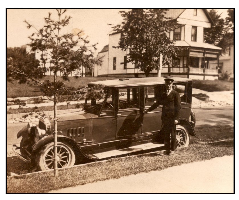
A motorized "hack" taxi on West Bridge Street.