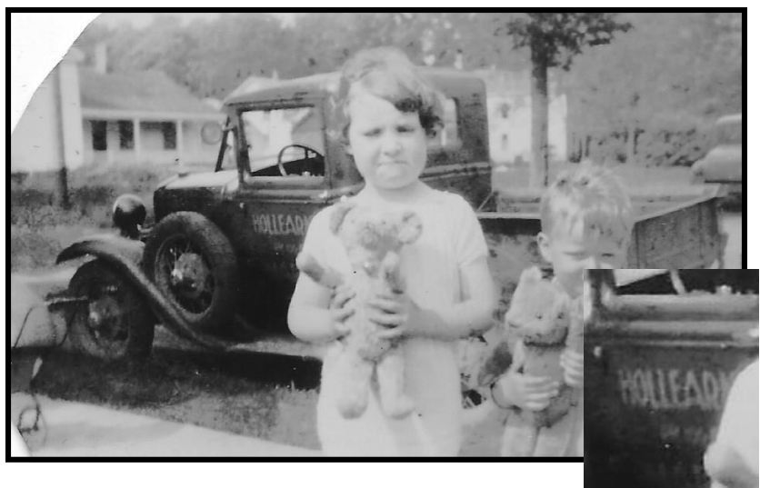
Hollearn's Grocery Store Delivery Truck