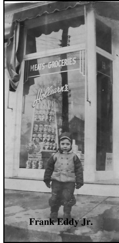
In 1993 the building was demolished and the new Rite Aid Drugstore was built in it's place.