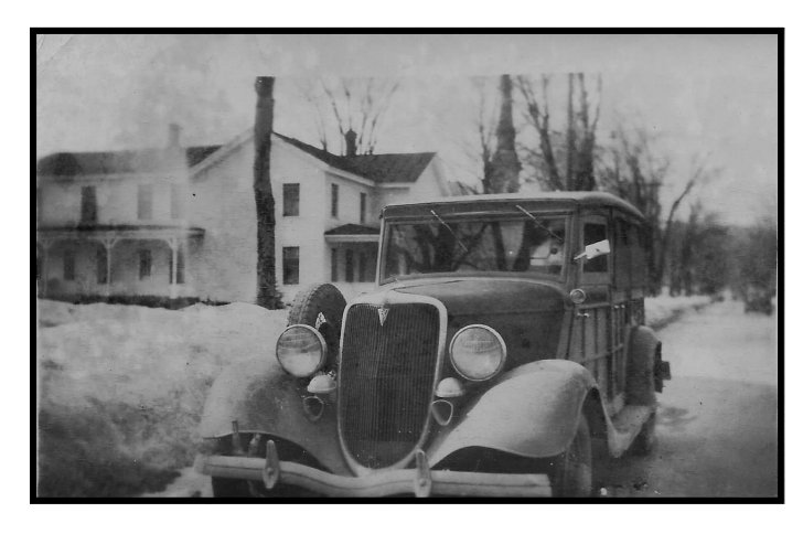
Hollearn Family Car