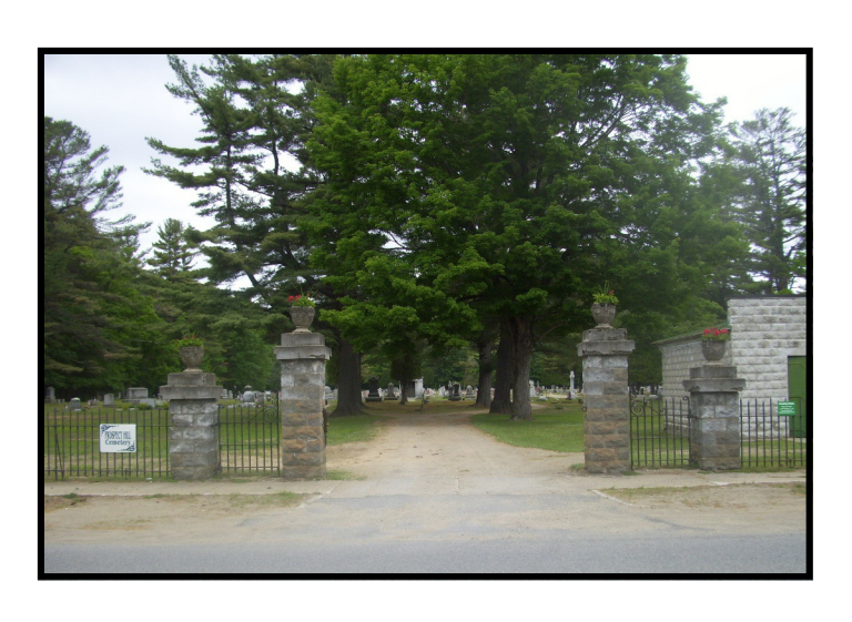
PROSPECT HILL CEMETERY