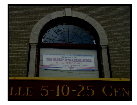
Willard Bros. 1914