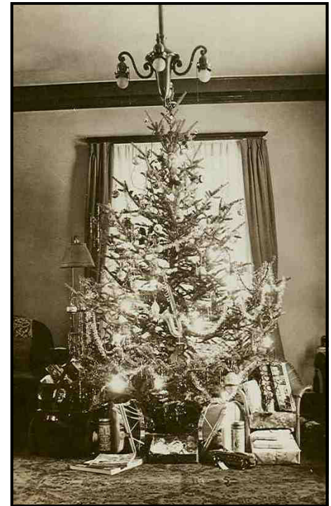
Christmas tree about 1940, in the house owned by Lynn and Pat Barnett.

Another early activity, in preparing for the holidays, was stringing popcorn for the evergreen's decoration. In preparing for this chore, much more popcorn was prepared that was needed for the stringing. The workers at the tree trimming bee would probably eat the surplus. "Snitched" corn, even without salt or butter, tasted pretty good. (continued on page 2)