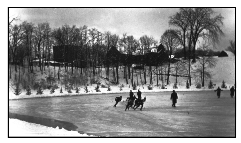
Mystery picture from last months newsletter